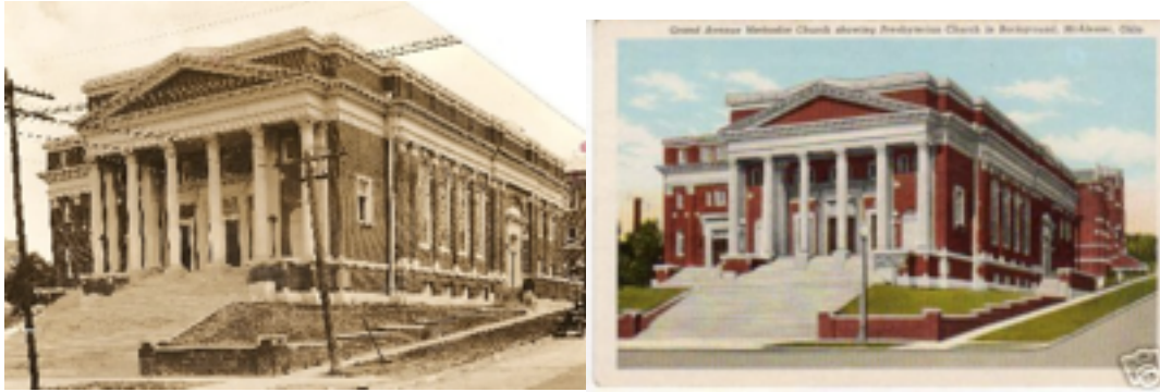
Grand Avenue as it appeared in 1924 and in a picture postcard from the 1940s

By the early 1920s, the membership of Mary Phillips M.E.C.S. was outgrowing its space. Several churches in the community were already making plans to replace their wooden structures with grander brick edifices. The cornerstone of Grand Avenue ME Church South was laid in 1922 and the first Service was held in the new sanctuary on January 6, 1924.