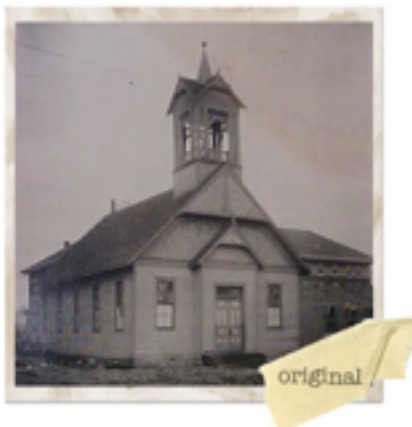
McAlester's interdenominational house of worship ca. 1900