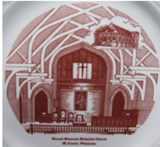
Barnett Memorial commemorative plate from 1973