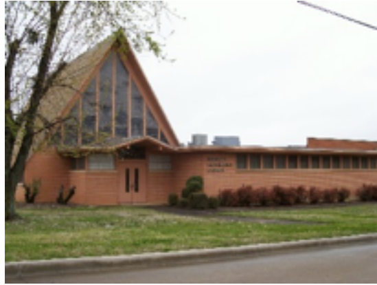
Wesley United Methodist Church, McAlester