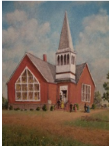
Mary Phillips Methodist Episcopal Church, South